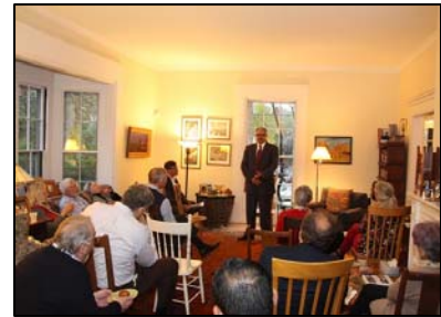
HRDC Boston fundraising event