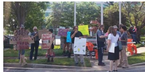
Protest at CCA’s 2016 annual meeting