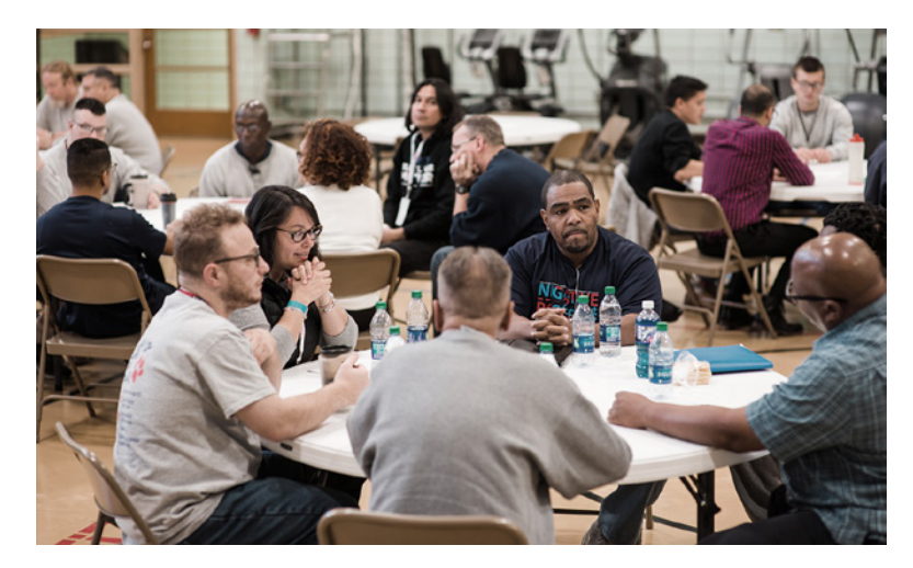
Students in the University of Iowa Liberal Arts Beyond Bars program at the Iowa Medical and Classification Center met in late 2019 with members of the KPI Advisory Council to share how the opportunity to pursue a postsecondary degree has impacted their outlook, their families, and the facility as a whole.