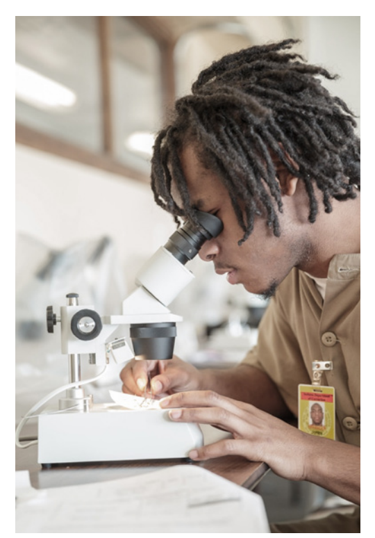
A student peers through a microscope in his Botany course at the Moreau College Initiative. Over 50 students have enrolled in this class since the Moreau College Initiative began to offer it in 2015.