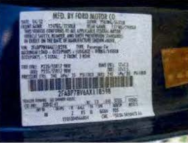
100_2562.JPG 2/18/2007 2:11:54 PM