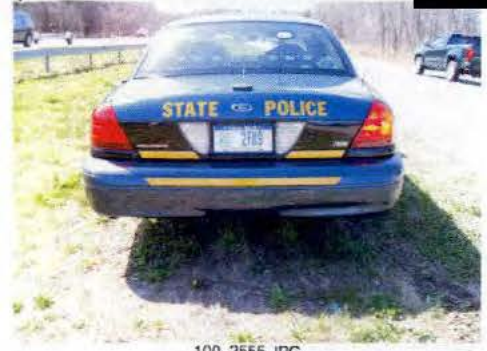
100_2555.JPG 2/18/2007 2:10:31 PM