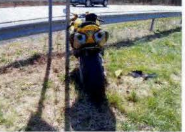
100_2552.JPG 2/18/2007 2:08:56 PM