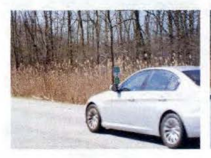
100_2567.JPG 2/18/2007 2:17:19 PM