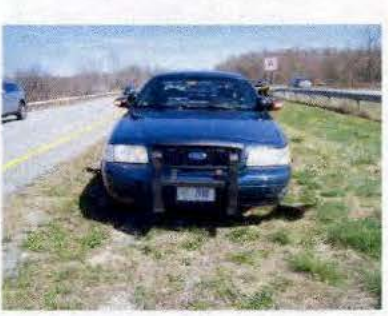
100_2558.JPG 2/18/2007 2:11:00 PM