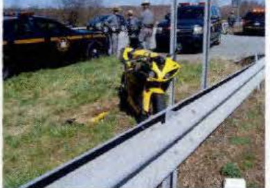
100_2554.JPG 2/18/2007 2:09:28 PM