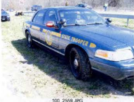
100_2559.JPG 2/18/2007 2:11:08 PM