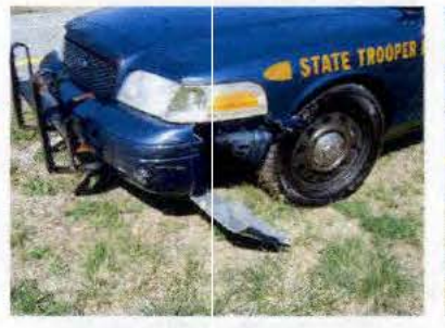
100_2557.JPG 2/18/2007 2:10:52 PM