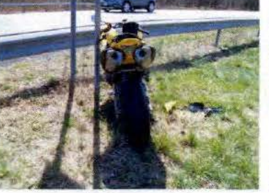
100_2552.JPG 2/18/2007 2:08:56 PM