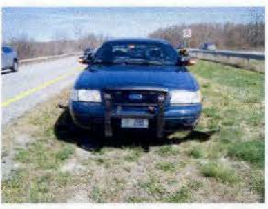
100_2558.JPG 2/18/2007 2:11:00 PM