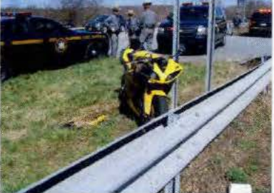
100_2554.JPG 2/18/2007 2:09:28 PM