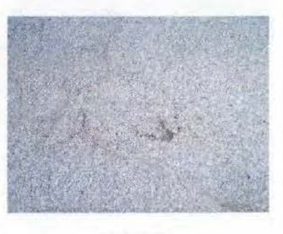
100_2566.JPG 2/18/2007 2:16:32 PM