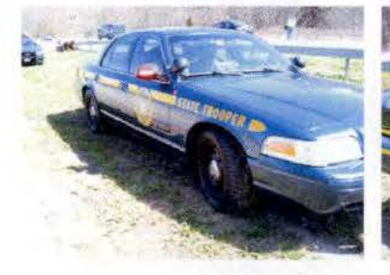
100_2559.JPG 2/18/2007 2:11:08 PM