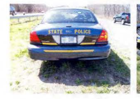
100_2555.JPG 2/18/2007 2:10:31 PM