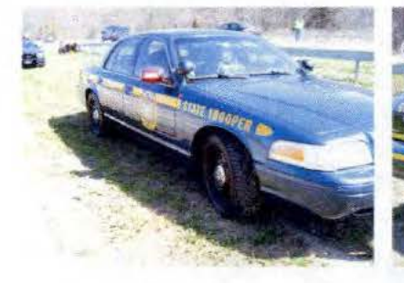
100_2559.JPG 2/18/2007 2:11:08 PM