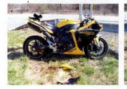
100_2551.JPG 2/18/2007 2:08:40 PM