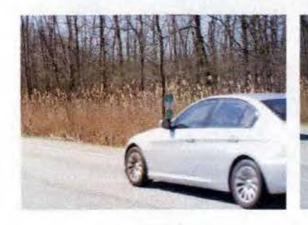
100_2567.JPG 2/18/2007 2:17:19 PM