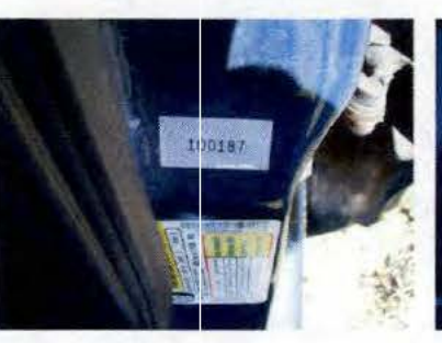
100_25i61.JPG 2/18/2007 2:11:41 PM