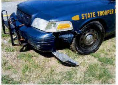
100_2557.JPG 2/18/2007 2:10:52 PM