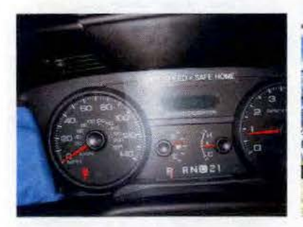
100_2563.JPG 2/18/2007 2:12:08 PM