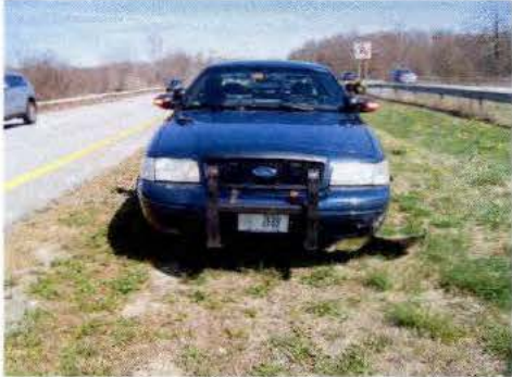
100_2558.JPG 2/18/2007 2:11:00 PM