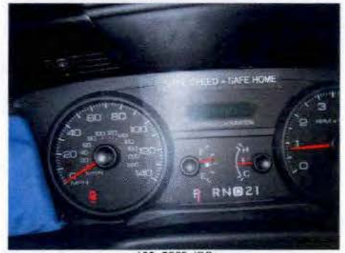
100_2563.JPG 2/18/2007 2:12:08 PM