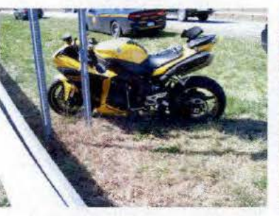
100_2553.JPG 2/18/2007 2:09:15 PM