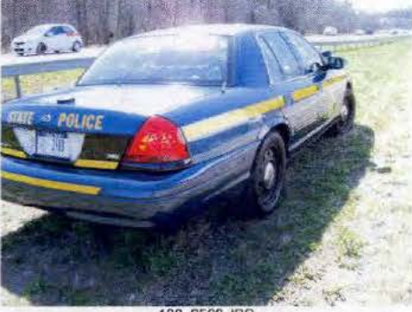
100_2560.JPG 2/18/2007 2:11:19 PM