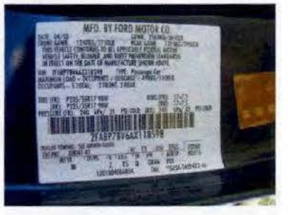
100_2562.JPG 2/18/2007 2:11:54 PM