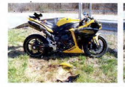
100_2551.JPG 2/18/2007 2:08:40 PM