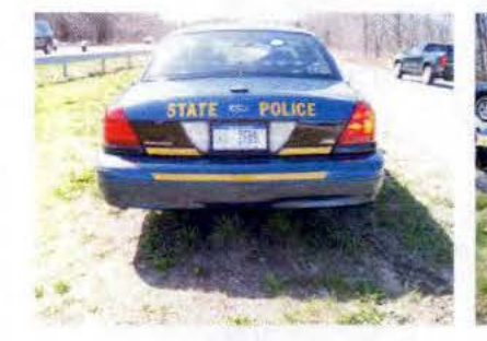
100_2555.JPG 2/18/2007 2:10:31 PM