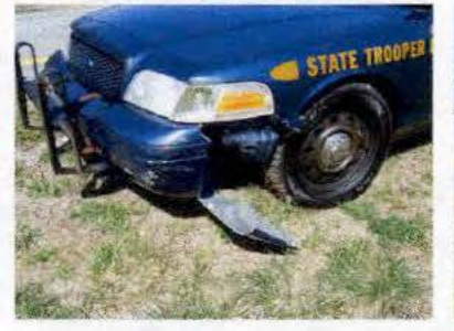
100_2557.JPG 2/18/2007 2:10:52 PM