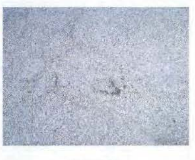
100_2566.JPG 2/18/2007 2:16:32 PM