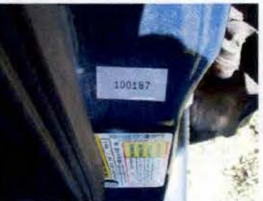
100_2561.JPG 2/18/2007 2:11:41 PM