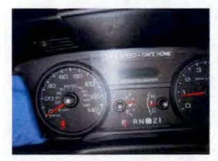
100_2563.JPG 2/18/2007 2:12:08 PM