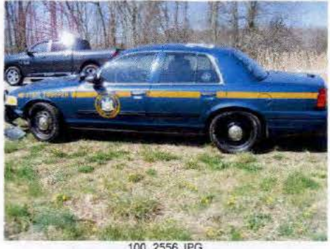
100_2556.JPG 2/18/2007 2:10:42 PM