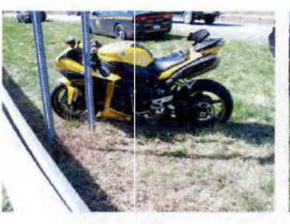
100_2553.JPG 2/18/2007 2:09:15 PM