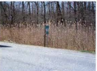
100_2568.JPG 2/18/2007 2:17:24 PM