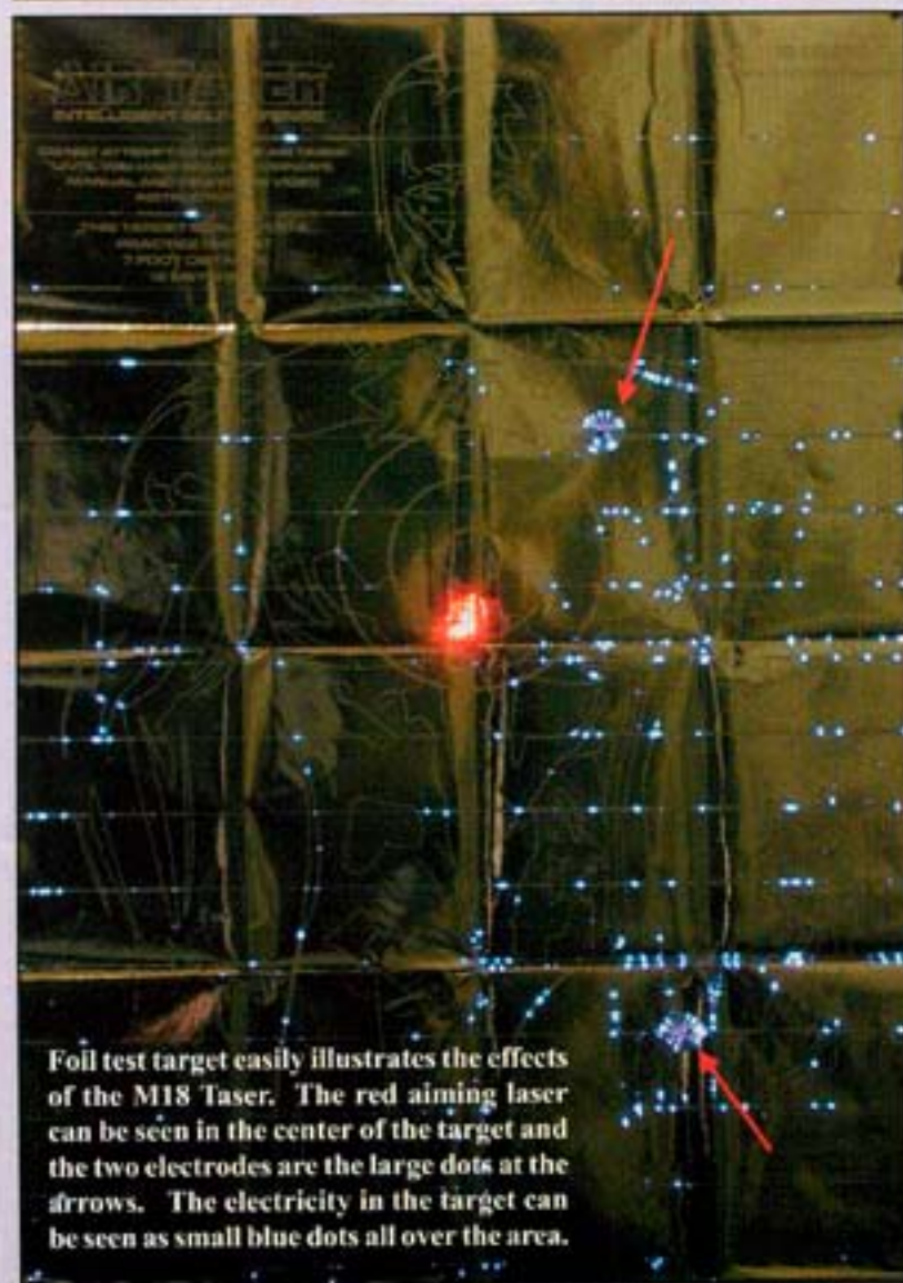
Foil test target easily illustrates the effects of the M18 Taser. The red aiming laser can be seen in the center of the target and the two electrodes are the large dots at the arrows. The electricity in the target can be seen as small blue dots all over the area.

training, and was completely shocked when he was unable to overcome it. I watched many other people come from the audience- military, law enforcement, even the local TV news crew, and they all dropped when hit. For a refreshing change, your faithful correspondent was able to learn from watching, and didn't find it necessary to take a "Hit" from the Taser. They told me I didn't know what I was missing- but if memory serves, I have a good reference on the sensations of being jolted with electricity and dropped like a rock in a pond, and I didn't feel the urge to relive those experiences. It was indeed impressive. (Gunney Marrero teaches his CQB "Close Quarters Battle" system in training programs for law enforcement- call 1-800-978-2737 ext 2016 for more information- he's a straight shooter with lots of the right credentials- Dan).