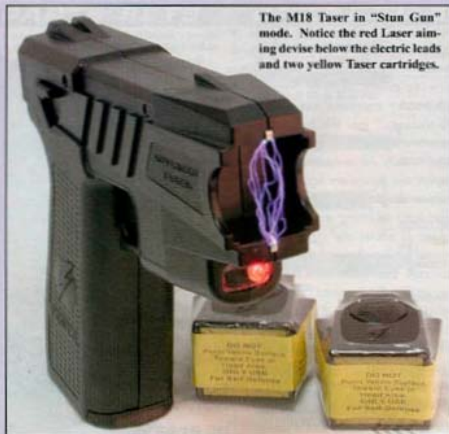
The M18 Taser in "Stun Gun" mode. Notice the red Laser aiming device below the electric leads and two yellow Taser cartridges.

The Taser utilizes what is termed "Electro-Muscular Disruption". Essentially, the Taser achieves the desired effect of the perfect sniper shot- Central Nervous System Shutdown, without kill-